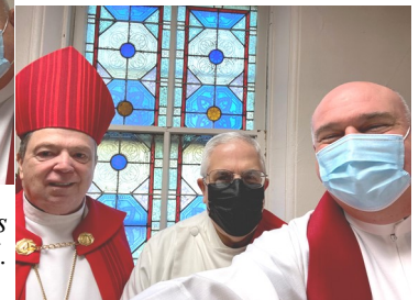
two Confirmation ceremonies at St. Ann on November 6.